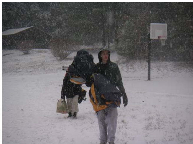
Breaking Camp in the Snow, Town Forest *****